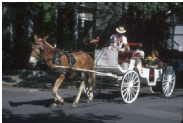
Carriage Ride by Carl Purcell

Stroll down to the riverfront aquarium where you can walk through a reef with stingrays and also see otters play. The kids will get a