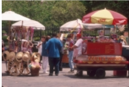
Jackson Square